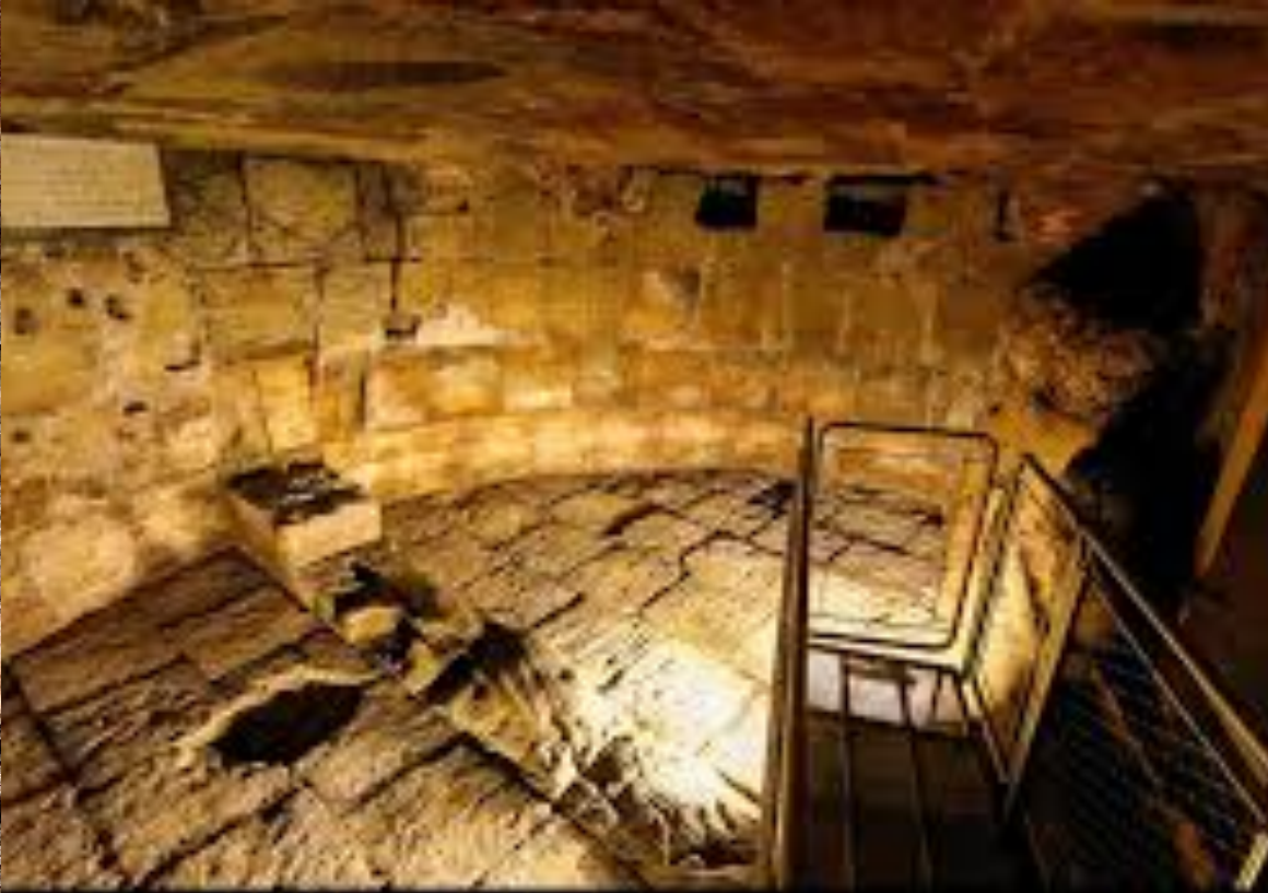
Mamertine Prison ancient cell of Paul's imprisonment