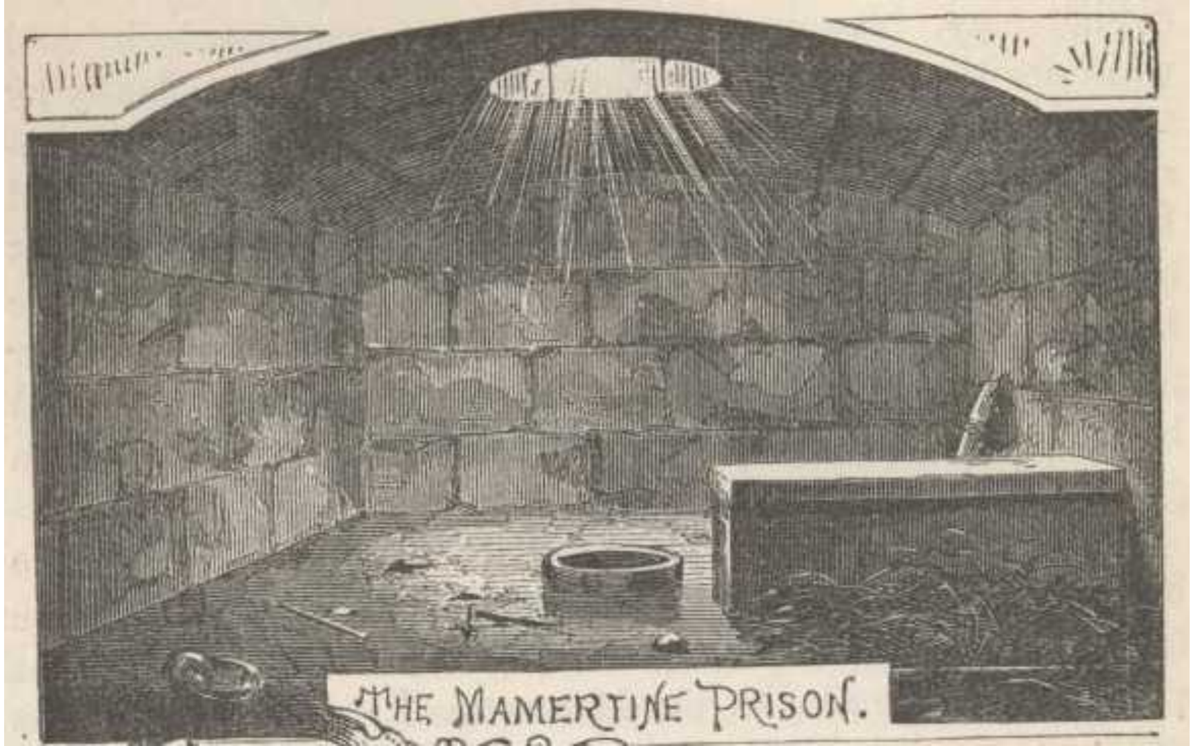
THE MAMERTINE PRISON.